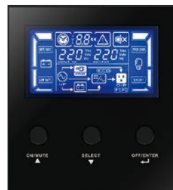
Control LCD Panel

PC, Servers, Networking Equipments, Security Systems, Medical Equipments etc.